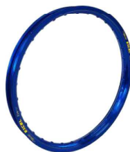
Blu con logo Rosso Blue with Red logo