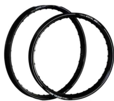
Nero con logo Bianco Black with White logo