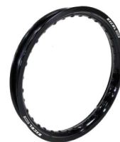
Nero con logo Bianco Black with White logo