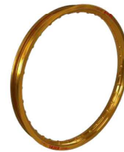
Oro con logo Rosso Gold with Red logo