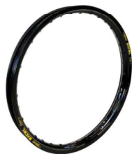
Nero con logo Giallo Black with Yellow logo