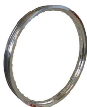
Silver con logo Rosso Silver with Red logo